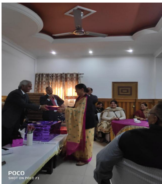
DEHRADUN FAMILY GET TOGETHER 13.01.2019