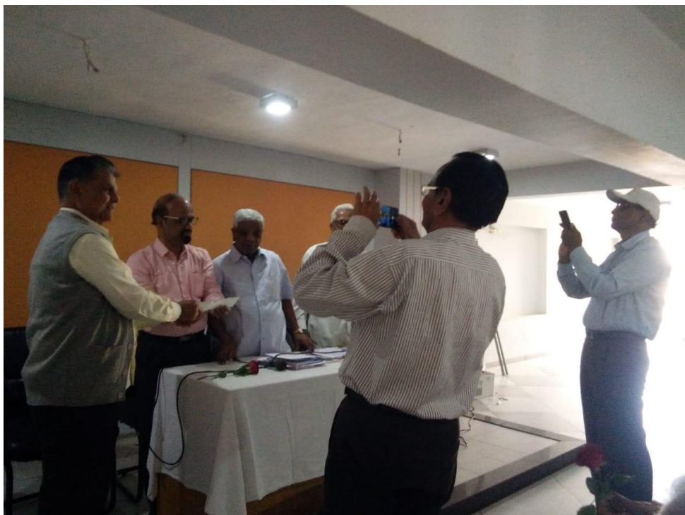
NASIK G. B. MEETING 4