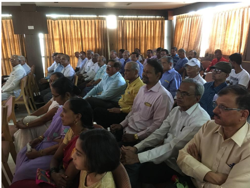
KOLAHPUR MEETING 3