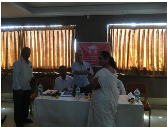
KOLAHPUR MEETING 1