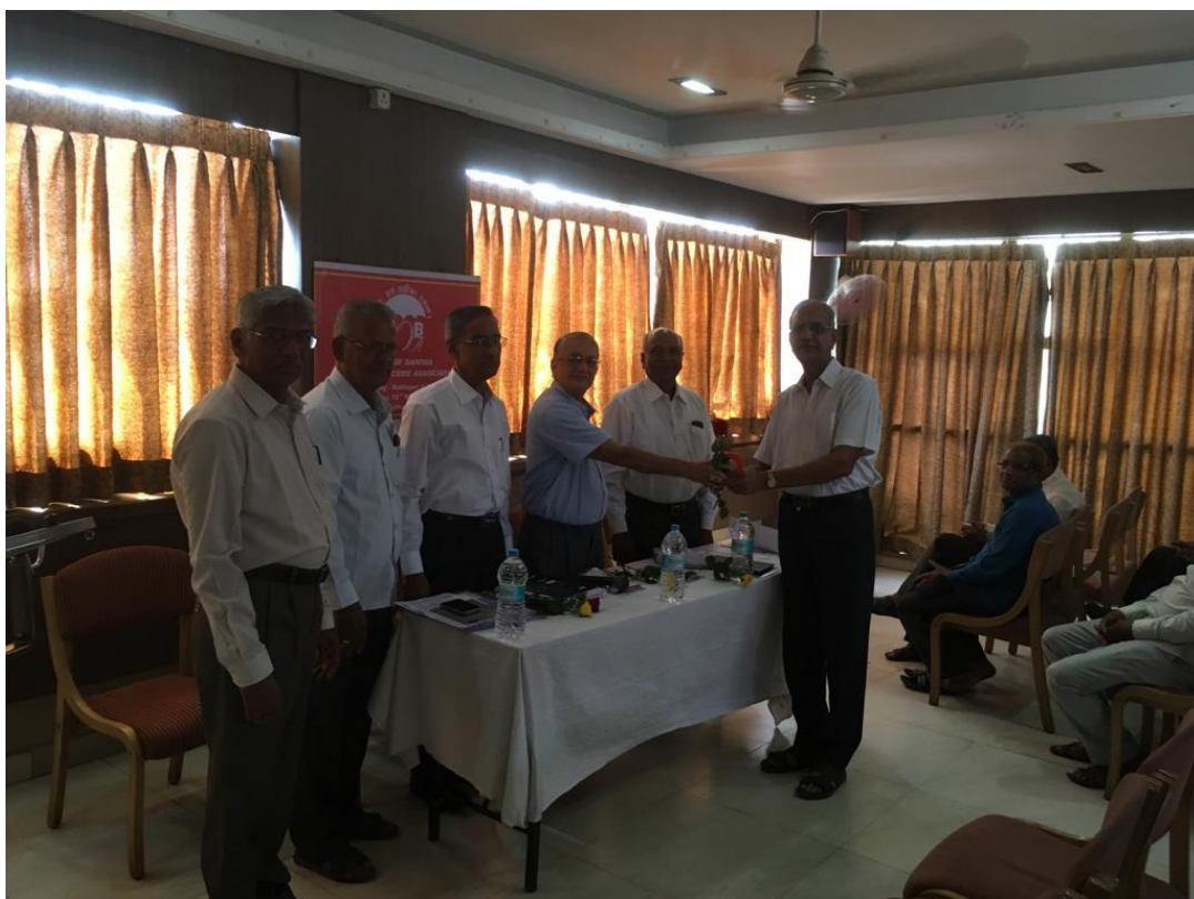
KOLAHPUR MEETING 2