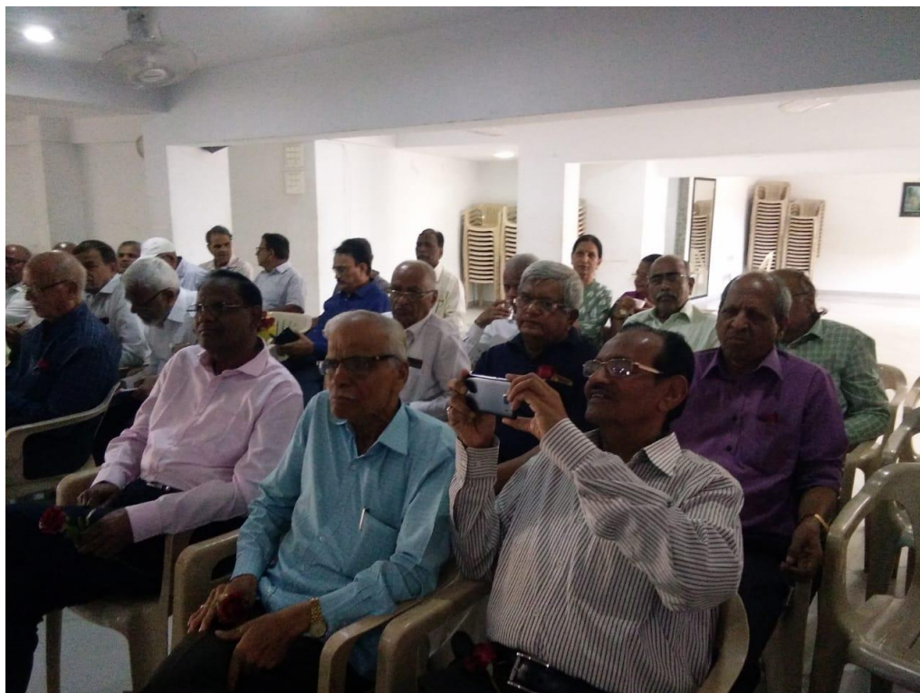
NASIK G. B. MEETING 11.03.2019